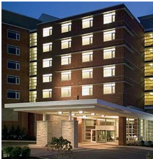
The Penn Stater Conference Center Hotel

On Tuesday, October 2, 2007, the Master Well Owner Network is hosting the first Pennsylvania Private Water Well Symposium at the Penn Stater Conference Center Hotel (shown above) in State College, PA.