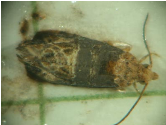
Grape Berry Moth Adults in Pheromone Trap

Disease phenology models based on daily temperatures and rain events also provide continuous current information on the timing of recommended fungicides against powdery and downy mildews and black and botrytis rots. This information can be combined with scouting information from individual vineyards and used in making pest management decisions.