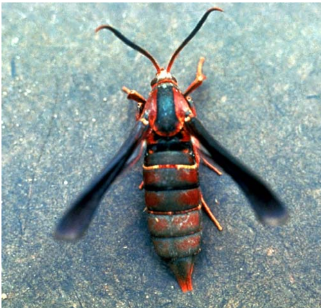
Grape Root Borer Adult